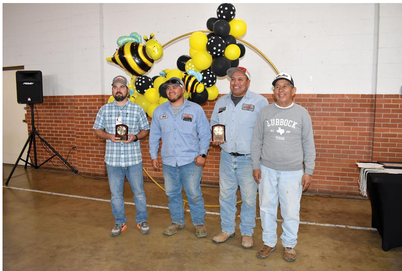
George R. Keeling Achievement Award City Parks Department & City Streets Department