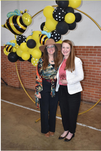
Main Street Hero The Wallace Theater

The Volunteer Lunch happens in conjunction with National Volunteer Appreciation Week. This year the theme is "Bee the Change, you wish to see!" We had the distinct honor of recognizing our volunteers that serve on our Main Street Advisory Board as well as our committees. We also go to honor the following 2022 Main Street Award Recipients: