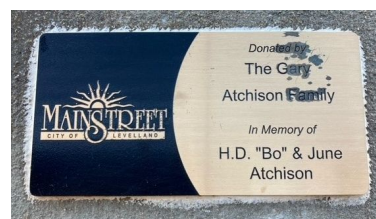
East Side of the Square