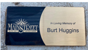
South Side of the Square