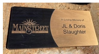
West Side of the Square