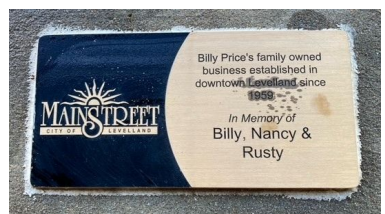
East Side of the Square