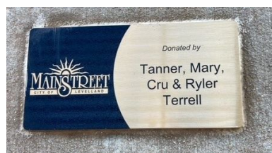
West Side of the Square