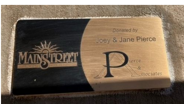
North Side of the Square