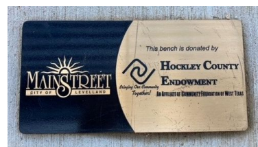
South Side of the Square

There are a lot of people that work behind the scenes in the Main Street District. For this edition I would like to recognize our bench sponsors around the perimeter of the "square." Beautifying downtown and adding elements that make things better for the community as a whole, is no simple task. The expense of one bench, heavy duty enough to sustain the sandblasting of the West Texas winds, the sun exposure, and wear and tear of continual public use, is substantial.