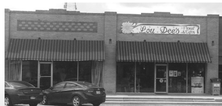
614 Ave H