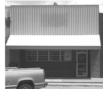
613 Ave G