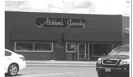
617 Ave G