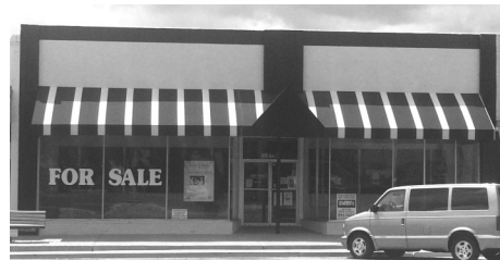
604 Ave H