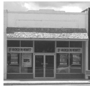
608 Ave H