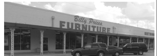
607 Ave G